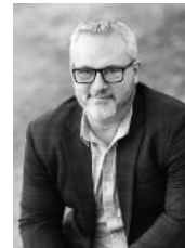
Representative Scott Bottoms (El Paso County)